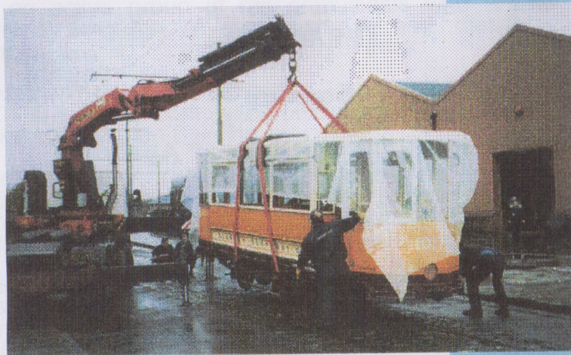
1017 being lowered onto the Summerlee track for the first time