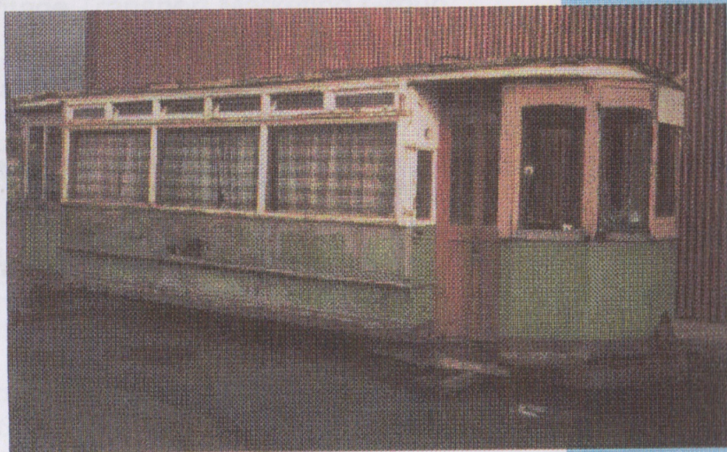
What a change!! 1017 shortly after arriving at Summerlee