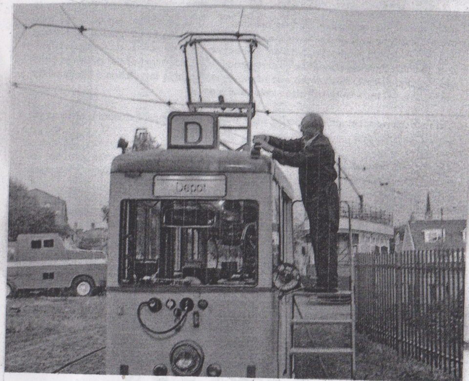
The Chairman at Work

The Magazine of Summerlee Transport Group