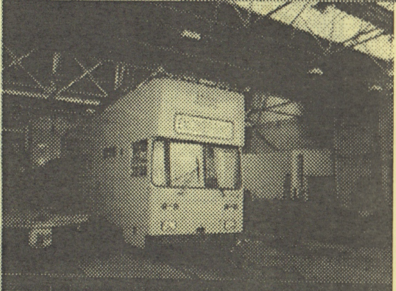
The ones you don't normally see! A selection of works cars pictured at Rigby Road Depot, Blackpool – many thanks to member Ian Simpson for these shots. Left: Permanent way works car 259 Top Right: Overhead line car 754 Bottom Right: Works car rail grinder 752.

Below: Restored as part of Channel 4's Salvage Squad programme, Lancastrian Transport Trust's vambac controlled Coronation 304 is pictured on an enthusiast's tour on 8 Nov 2003 alongside sister car 330 and former Blackpool Transport training PD3 516. It is the first time both cars have run together since 1975!